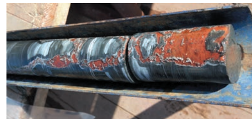
Core 85 mm

The generation of energy from methane, with the remnant carbon dioxide, lessens environmental damages while at the same time substituting a fossil energy source.