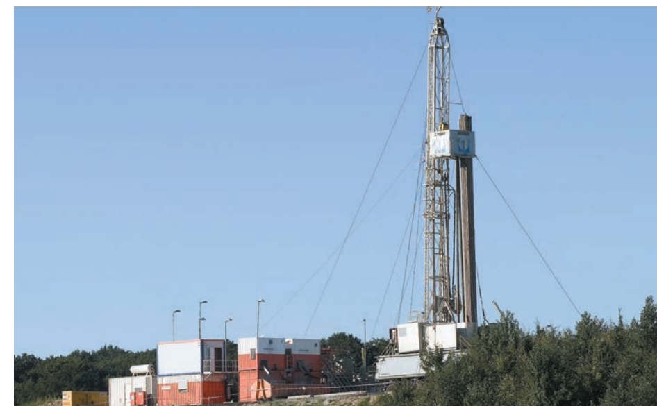
Core holes up to 1500 meters

Abandoned mine management is gaining more and more importance for Anger. Former mining regions require complex solutions and innovative work plans, so as to keep in check long-term consequences that result from decades of mining. To achieve this goal the company co-operates with external specialists and qualified employees in every single project.