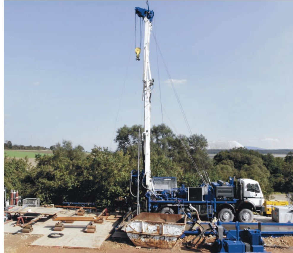
Drilling rig 400 kN

It is of great importance to eliminate any subsidence or uplifting which may result from former mining. It is for this purpose that drilling becomes necessary, to plug the well or to retain the water there permanently. This serves to maintain the security of the respective area.