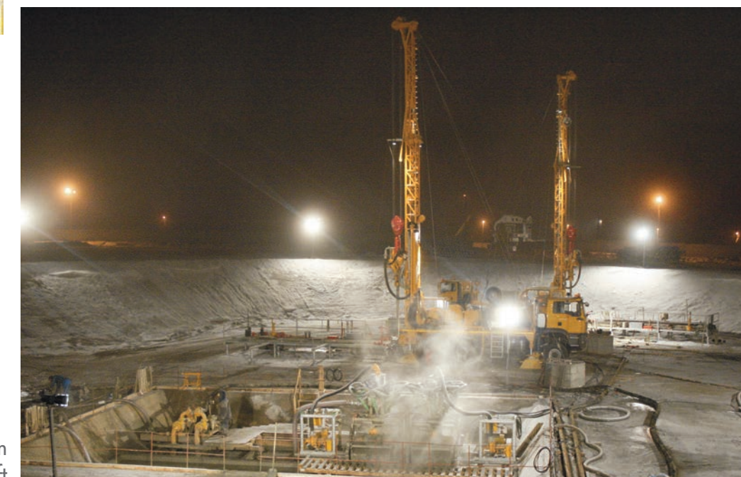
44 wells at 550 m for freeze shaft

Up to this day H. Anger's Söhne, too, has applied the freezing hole technique successfully.