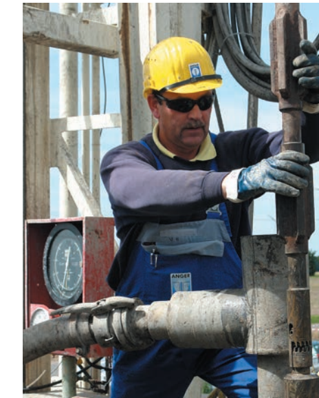
Employee at working platform

In this field, wireline core drilling is often used for an exact determination of the content of ore and minerals, as well as for a specification of other geotechnical parameters.